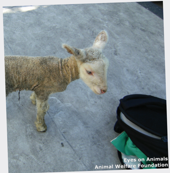
Eyes on Animals Animal Welfare Foundation

WE BELIEVE THAT THE EU'S INHUMANE LIVE EXPORT TRADE MUST BE BROUGHT TO AN URGENT END.