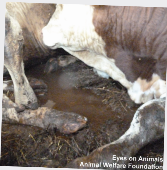
Eyes on Animals Animal Welfare Foundation

EU law prohibits the transport of heavily pregnant animals, yet this lamb was born on truck during delay at EU-Turkey border.